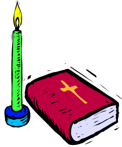
Heroes of the Bible Chapter 2